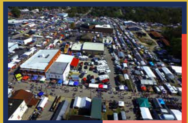
Annual Court Days Festival third Monday in October and weekend prior