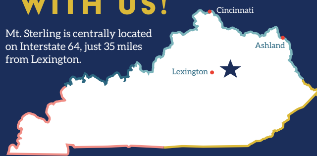
Mount Sterling, Kentucky

Mt. Sterling is centrally located on Interstate 64, just 35 miles from Lexington.