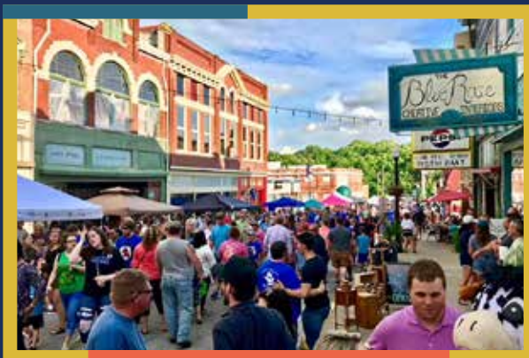
First Friday Market